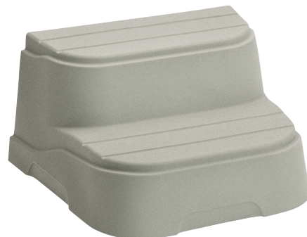
Shown in Sand