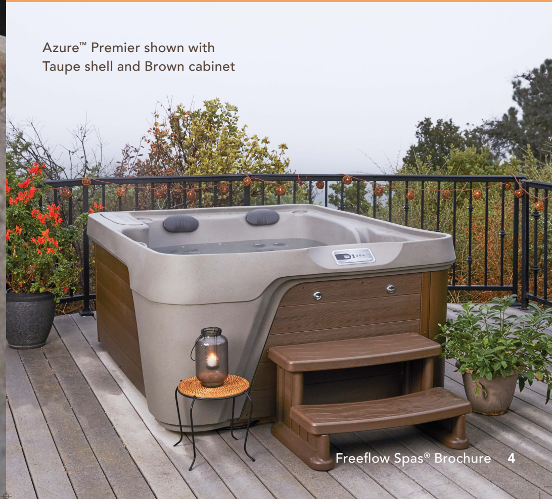
Azure™ Premier shown with Taupe shell and Brown cabinet