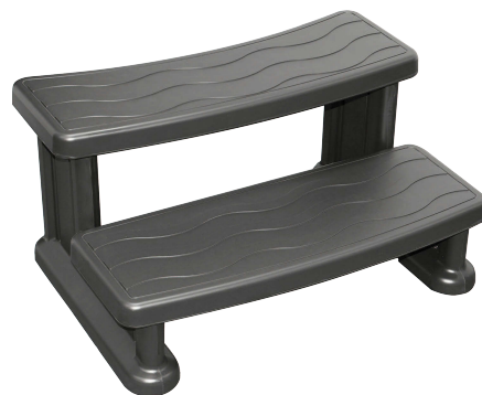
Shown in Charcoal