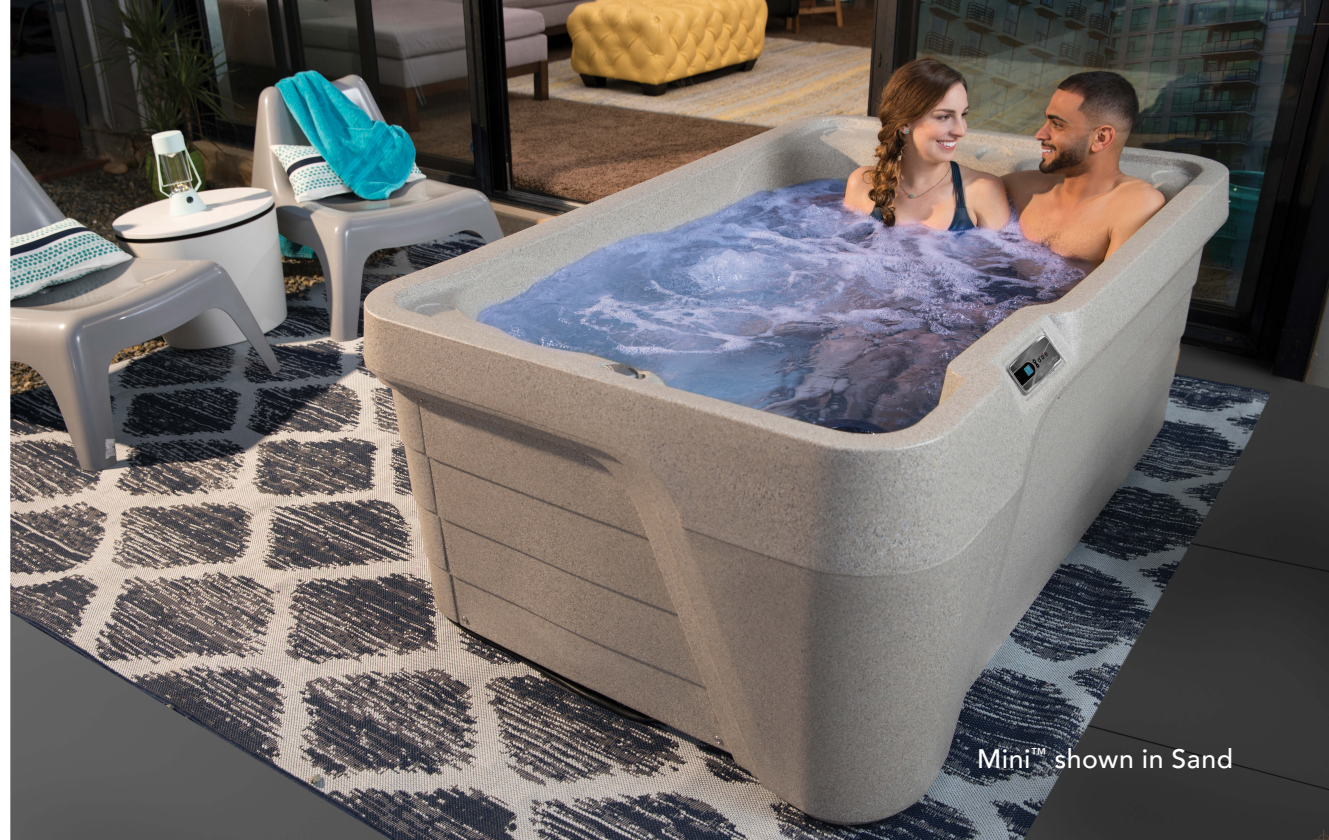
Mini™ shown in Sand