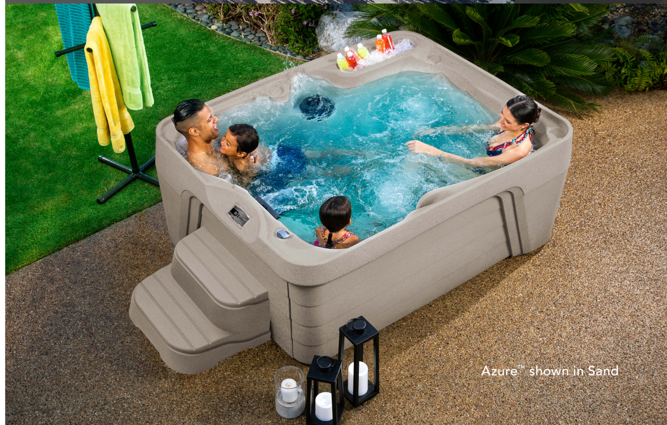
Azure™ shown in Sand