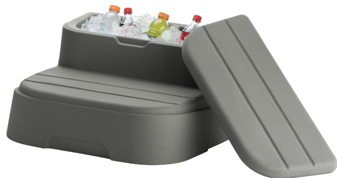
Shown in Taupe

Pairs With: Premier Series: Azure™, Excursion®, Monterey™; Sport Series: Azure™, Cascina®, Excursion®, Mini™, Monterey™, Tristar™