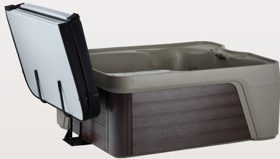
Azure™ Premier shown with Taupe shell, Brown cabinet, and Rx cover lifter.