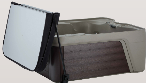
Azure™ Premier shown with Taupe shell, Brown cabinet, and Low Mount cover lifter