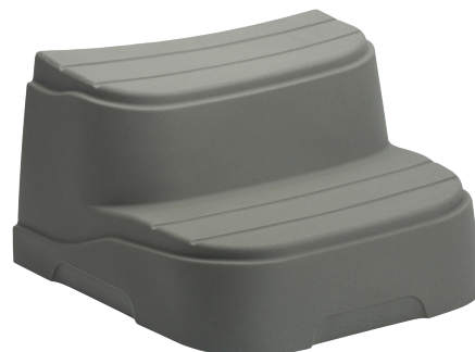
Shown in Taupe